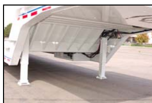
Optional hydraulic jacks