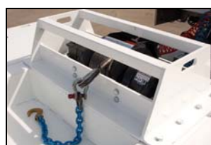
Standard 20,000# winch