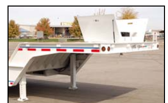
Standard tool boxes in fifthwheel area