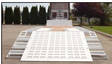
Optional pull-out outriggers

TRAILMAX QUALITY, BACKED BY A 5-YEAR STRUCTURAL WARRANTY